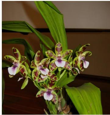
Alex Nadzan's exotic Zygopetalum Pine Road